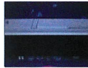
PlayStation Vita puts power in hands of gamers