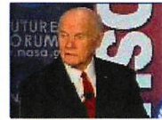
Glenn Bemoans Lack of U.S. Space Vehicle