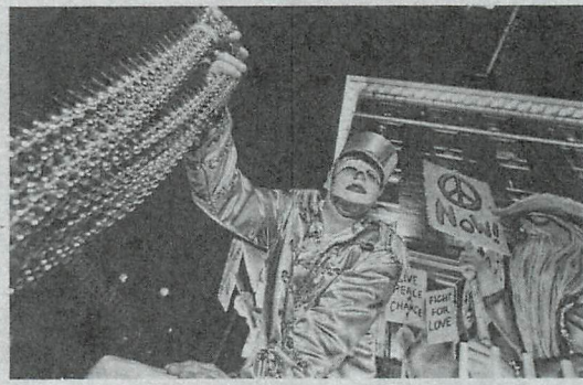
A handful of beads for crowds in Mobs, Ala., on Thursday. Mardi Gras festivities in towns coast will culminate in Fat Tuesday celebrations next week.