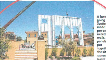
A $1.7 million home is going up in north Scottsdale's Silverleaf community using pre-engineered, factory-built steel walls.

Here are other specific plans to expand housing aid advocated by President Barack Obama during his appearance in Phoenix last month: - Replace Fannie Mae and Freddie Mac, government-owned mortgage giants, with a private insurance group funded by lenders. - Waive closing costs for more borrowers to refinance through the current Home Affordable Refinancing Plan. Homeowners with good credit and Fannie Mae and Freddie Mac-backed mortgages now can refinance no matter how underwater they are on their loans. - Cut red tape for borrowers who qualify and are trying to get loans now that lenders have eased their requirements significantly. - Fix the nation's immigration policies to help boost homeownership and home values. - Create incentives to spur development of more affordable rental housing.